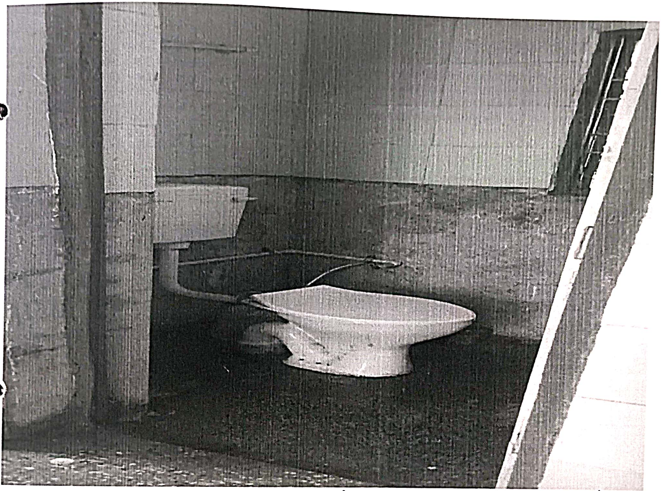
Washroom in the girls Hostel for the Physically disabled girls

Dr Principal, Govt. College of Teacher Education Dharamshah, Dist. Kangra (H.P.) Ph. No. 01902-223140